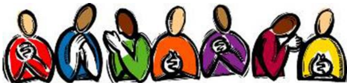
Centering Prayer Group