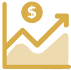
gifts of STOCK

Please be certain to have all transactions COMPLETED by December 29 th in order for that gift to appear on your 2023 giving statement.