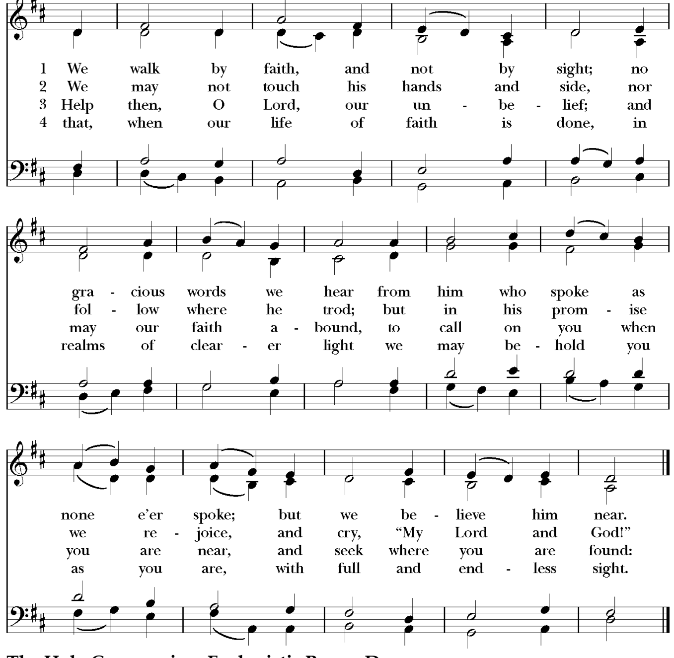
The Holy Communion: Eucharistic Prayer D