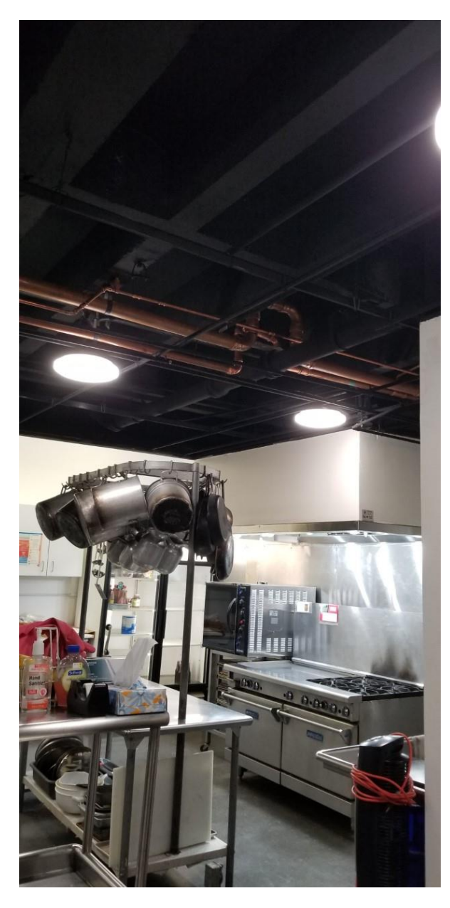
Sheila Kinnebrew & Allien McNair, THANKS for all the extra work to move fixtures, deep clean and return fixtures to their positions.

Following the final repairs to the plumbing issues we encountered in the ceiling of the kitchen we removed the remaining ceiling, painted and installed new light fixtures.