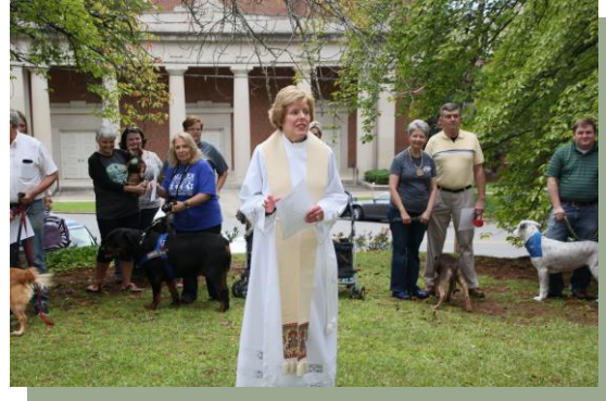
“ And this is how we do it”