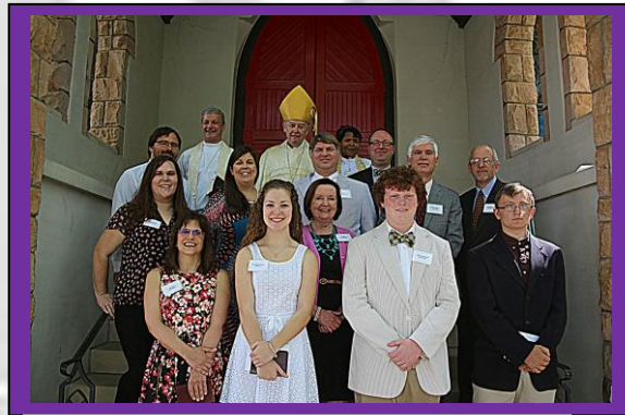
The newly confirmed and received