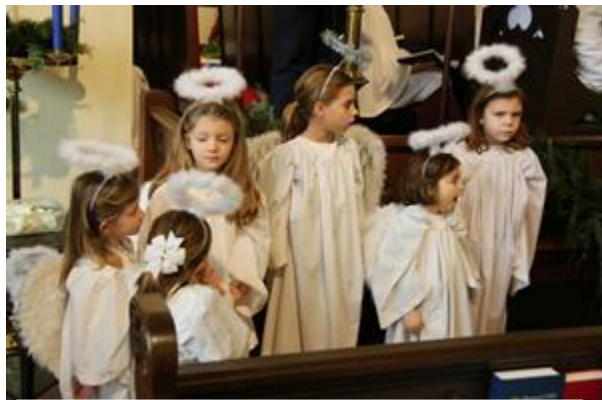
St. Peter's Angels