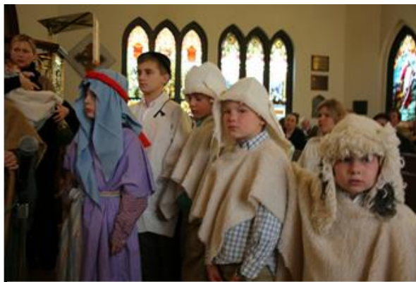
Sheep and Other Animals at the Manager