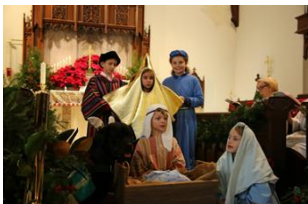
Mary and Joseph with the Christmas Star