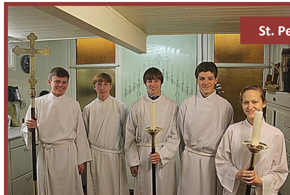
St. Peter's acolytes prepare for the Bishop's visit