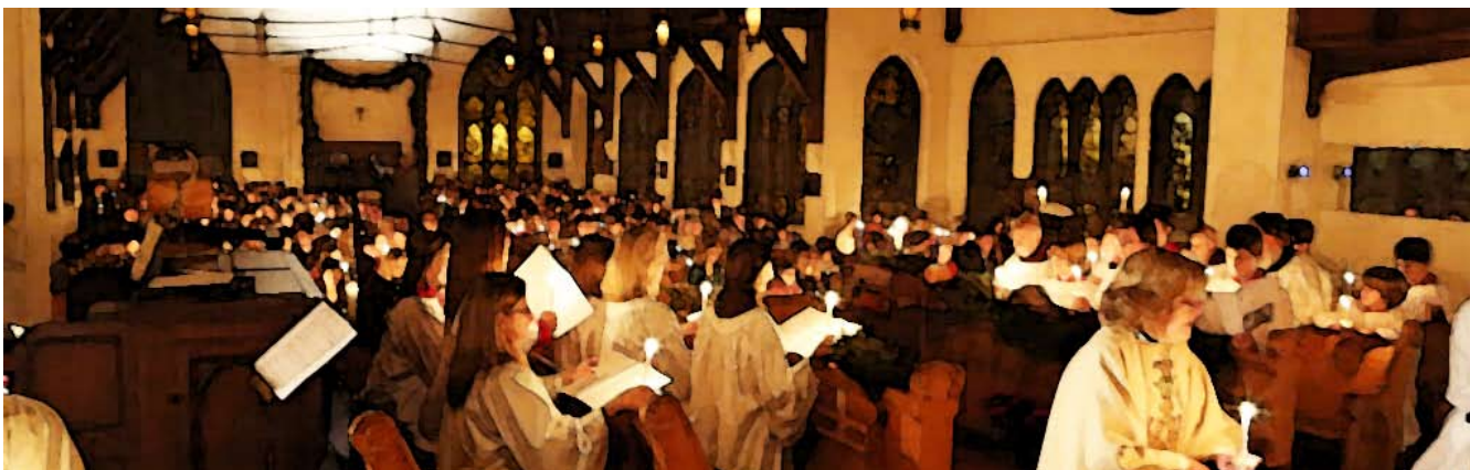
St. Peter's Christmas Eve, 2012.