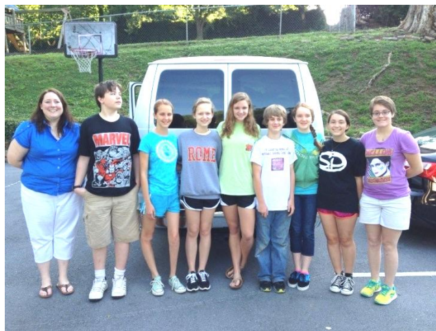
EYC Mission Team just prior to departing for Houston, Texas