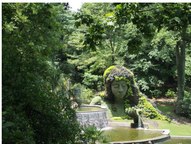
JOY trip to the Atlanta Botanical Garden