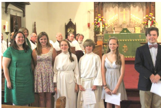
Commissioning of EYC Mission Team